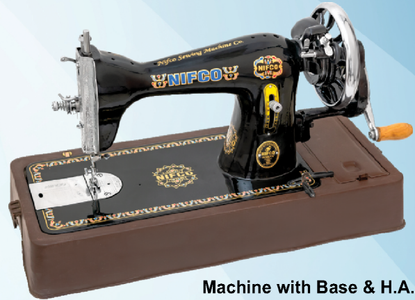
Machine with Base & H.A.